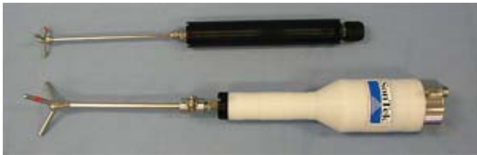
Top: Standard Conditioning Module Bottom: Conditioning Module with Sensors

The standard ADV signal conditioning module (for ADVFields with no optional sensors) is a cylindrical acetyl (Delrin) housing. The cable to the processing module attaches using an underwater mateable connector. The probe is permanently mounted to the front of the housing.