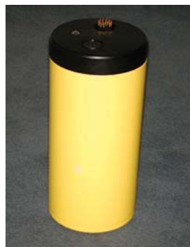
ADVField Underwater Processor

The ADVField processor can also be housed in an underwater canister with separate underwater mateable connectors to the probe and the external interface (power, communication, and auxiliary input/output). The power and communication cable can be up to 1500-m long for deployment in a wide range of environments.