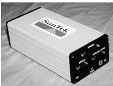
ADVField Splashproof Processor

For applications where the ADV processor does not need to be submerged, the processor is enclosed in a splashproof housing with connectors for the probe, power, communication, and auxiliary input/output (analog voltages and external synchronization). The splashproof housing can include an internal rechargeable battery (capacity for 6-10 hours of operation).