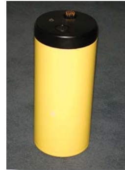
ADVField Underwater Processor