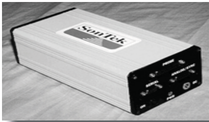
ADVField Splashproof Processor